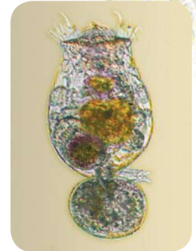
Rotifer ( Brachionus plicatilis ) grown using RotiGrow Plus