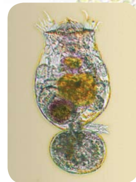
Rotifer ( Brachionus plicatilis ) grown using RotiGrow algae