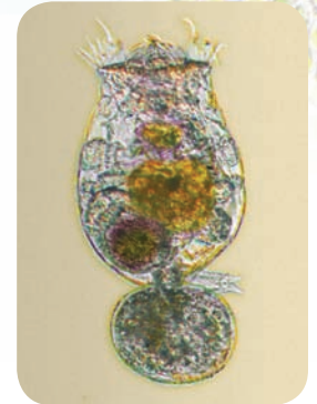
Rotifer ( Brachionus plicatilis ) grown using RotiGrow algae